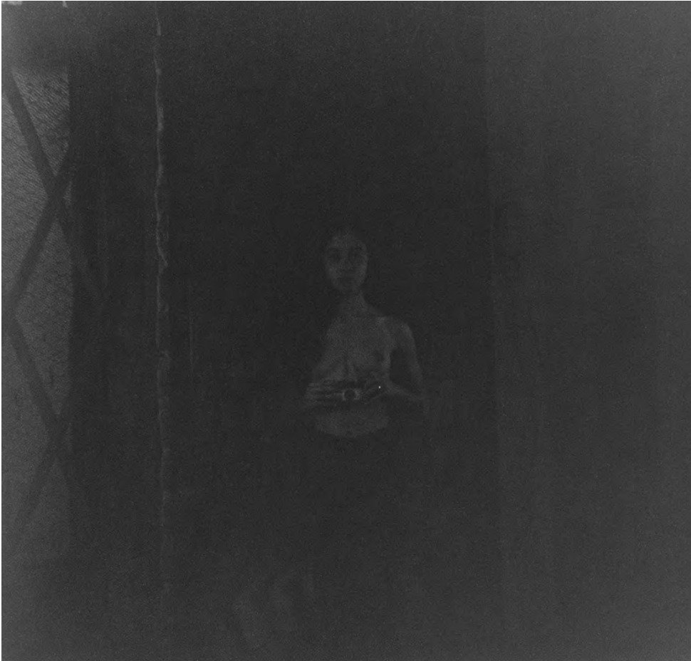
10. Food for the Spirit #6. 1971