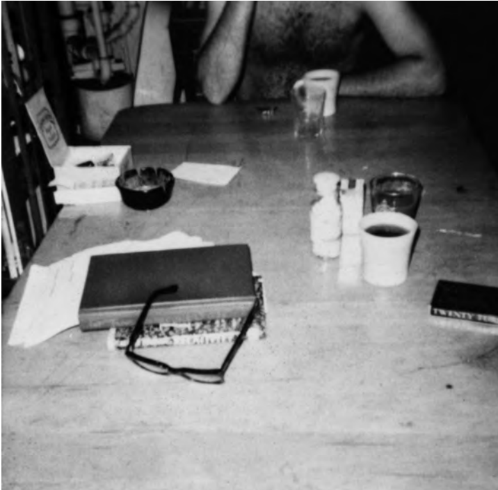
8. Hypothesis Situation #2 . 1968