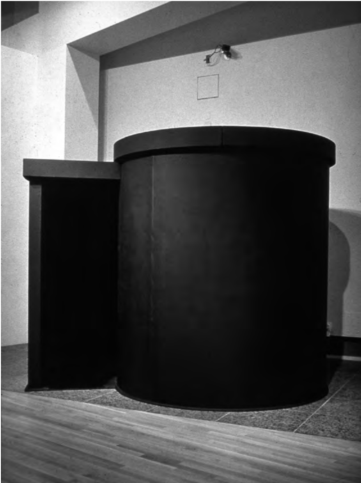
1. Four Intruders Plus Alarm Systems . 1980

Adrian Piper's installation Four Intruders Plus Alarm Systems (1980) (figs. 1, 2) is a wooden, conchlike construction, admitting only a few visitors at a time. In the darkened space within, the viewer faces backlit photographs of four black men; the light radiating from the men's eyes illuminates the small space. Equipped with headphones, the viewer hears four in-character monologues, spoken by Piper, each lasting several minutes. The monologues express reactions by potential spectators, and each reveals a problematic political attitude. One voice might be described as that of a politically apathetic aesthete: "It's an interesting attempt to disrupt my composure as an art viewer . . . [but] I don't think that it works as art, because I really couldn't care less about racial problems when I come to a gallery"; and another as that of a disappointed suburban moralist: "She's representing all blacks as completely hostile and alienated, and I just think that that's not true. . . . I know lots of black people. . . . Well, of course I wouldn't advise my daughter to marry one . . .