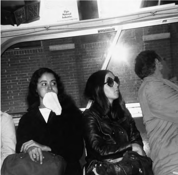
9. Catalysis IV . 1970.