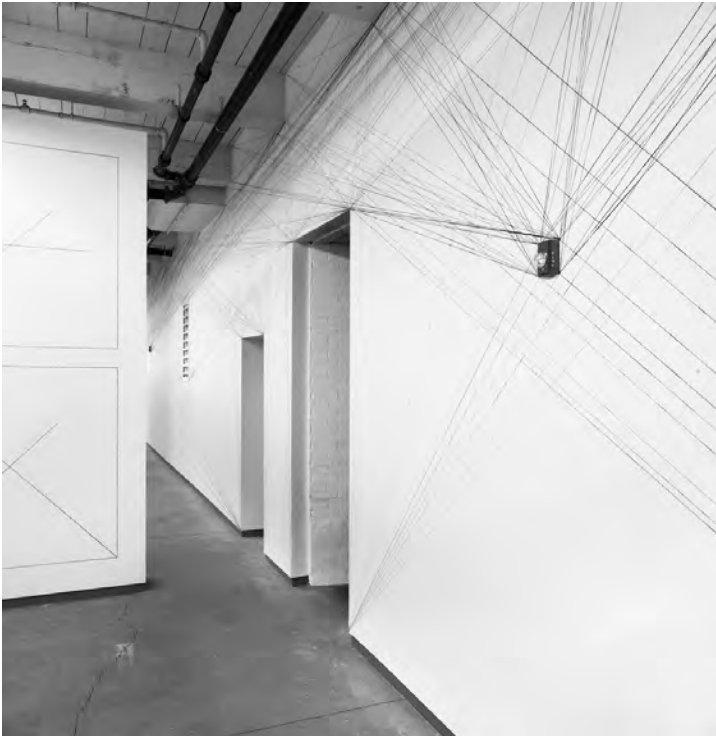
6. Sol LeWitt. Wall Drawing #51 . 1970