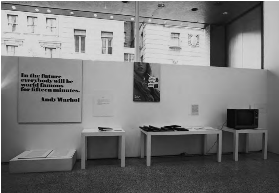
3. Installation view of Information , The Museum of Modern Art, New York, July 2–September 20, 1970

2. Piper, "Three Models of Art Production Systems," in Kynaston McShine, ed., Information (New York: The Museum of Modern Art, 1970), pp. 111; reprinted in Piper, Out of Order, Out of Sight , vol. 2, Selected Writings in Art Criticism, 1967–1992 (Cambridge, Mass.: MIT Press, 1996), p. 13.