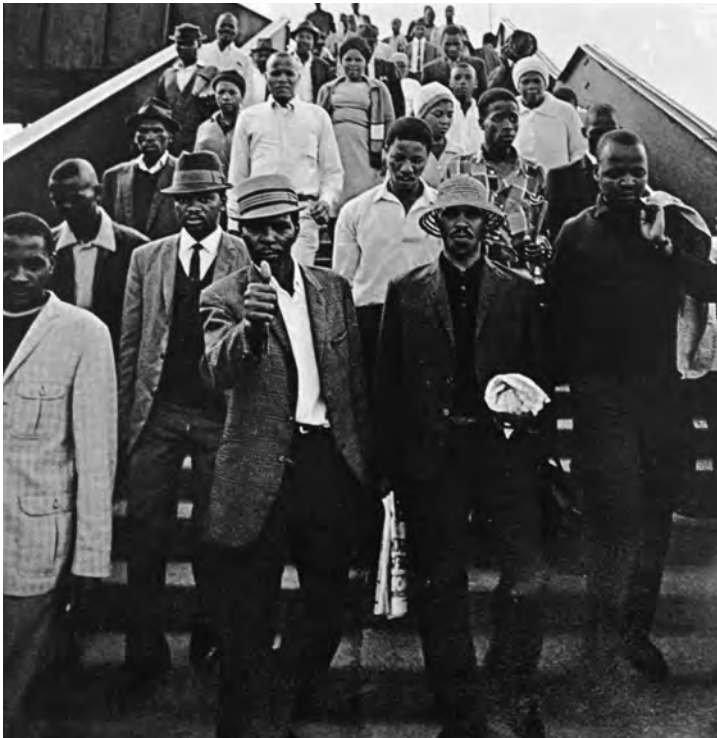
15. Aspects of the Liberal Dilemma . 1978

A few of Piper’s later works, like the Catalysis series, utilize Piper’s own presence as the catalytic effect on the viewer. But whereas in Catalysis IV the artist is a bizarre unannounced apparition on the public transport, in the video installation Cornered (1988) (pp. 43, 148) she appears in a neutral blue cardigan and pearls; she is perhaps even conservatively dressed for an art-world presence. She smiles at us, holds our gaze, and then announces plainly, “I am black.” Perhaps we feel, Piper tells us, that she is making “an unnecessary fuss” by declaring her identity in this way, but if she does not announce her identity, she has to put up with racist remarks that white people make in her presence, believing that she is white. 62 In this way, Cornered is one of a number of works that thematize Piper’s personal predicament, as well as her family’s, as black persons who can “pass” for white. 63 Evoking what has been described by social psychologists as covert racism, these works address the tendency of white subjects to endorse illiberal or racist beliefs in nonpublic and all-white environments. 64 The work is not only