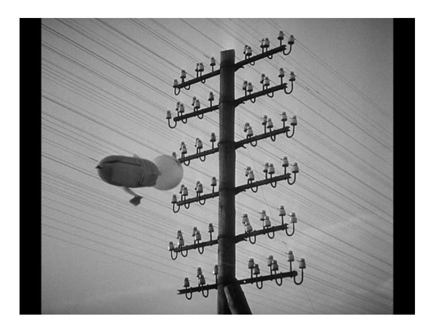
Figure 5: radical metonymy in M (Fritz Lang, 20<sup>th</sup> Century Fox, 1931).

'radicalized rhetoric' of American avant-garde filmmaking. Peterson labels the first of these two types of editing radical metonymy . In ordinary metonymy, a complex action or sequence of events is represented by a single salient detail; an entire trip might be represented by a single shot of a character seated on an airplane, for example. In radical metonymy, however, we are required to infer an event on the basis of a marginal detail rather than a central and salient feature. In Fritz Lang's M (1931), for example, in order to understand the story, we have to infer that the little girl Elsie has been murdered by virtue of the sight of her balloon – which we have seen the child murderer buy her – drifting free and becoming entangled in telephone wires (figure 5). The balloon stands in metonymically for Elsie (and perhaps there is a hint of metaphor in the way that the telephone lines trap the balloon). An ordinary use of metonymy here might involve a shot of a single limb of the dead girl, or the sound of her cries heard off-screen: parts of the action which more directly represent the whole action (the murder).