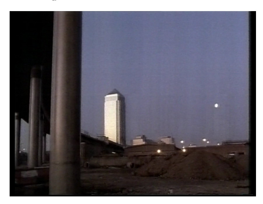
Figure 1: Sundial (William Raban, 1991)

the world itself) and traditional musical form (scores based on conventional uses of melody, harmony and rhythm). William Raban's Sundial (1991), for example, creates a playful montage based on the sights and sounds of East London around the original Canary Wharf tower (figure 1). The sounds of traffic, trains, voices, jackhammers and other urban sonic detritus are abstracted and structured into patterns of similarity and contrast, sometimes flowing, at other times staccato, in their development. We never lose sight of the fact that we are looking at a miniature portrait of a corner of London; but it is equally plain that the film aspires to a kind of musicality, one born in part out of the Klangfarbenmelodie woven into the soundtrack.