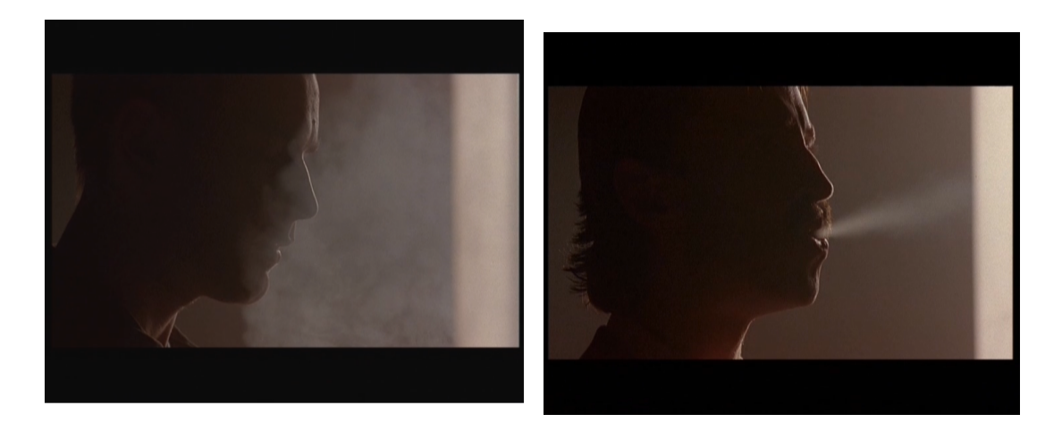
Figures 8.1 – 8.2: 'contranuity' editing in 'Twin Earth Trainspotting.'

That said, there are much trickier cases than Smith's Silent Symphony. Consider Twin Earth Trainspotting, in which our assumptions about spatial direction are systematically disrupted (figures 8.1 - 8.2):