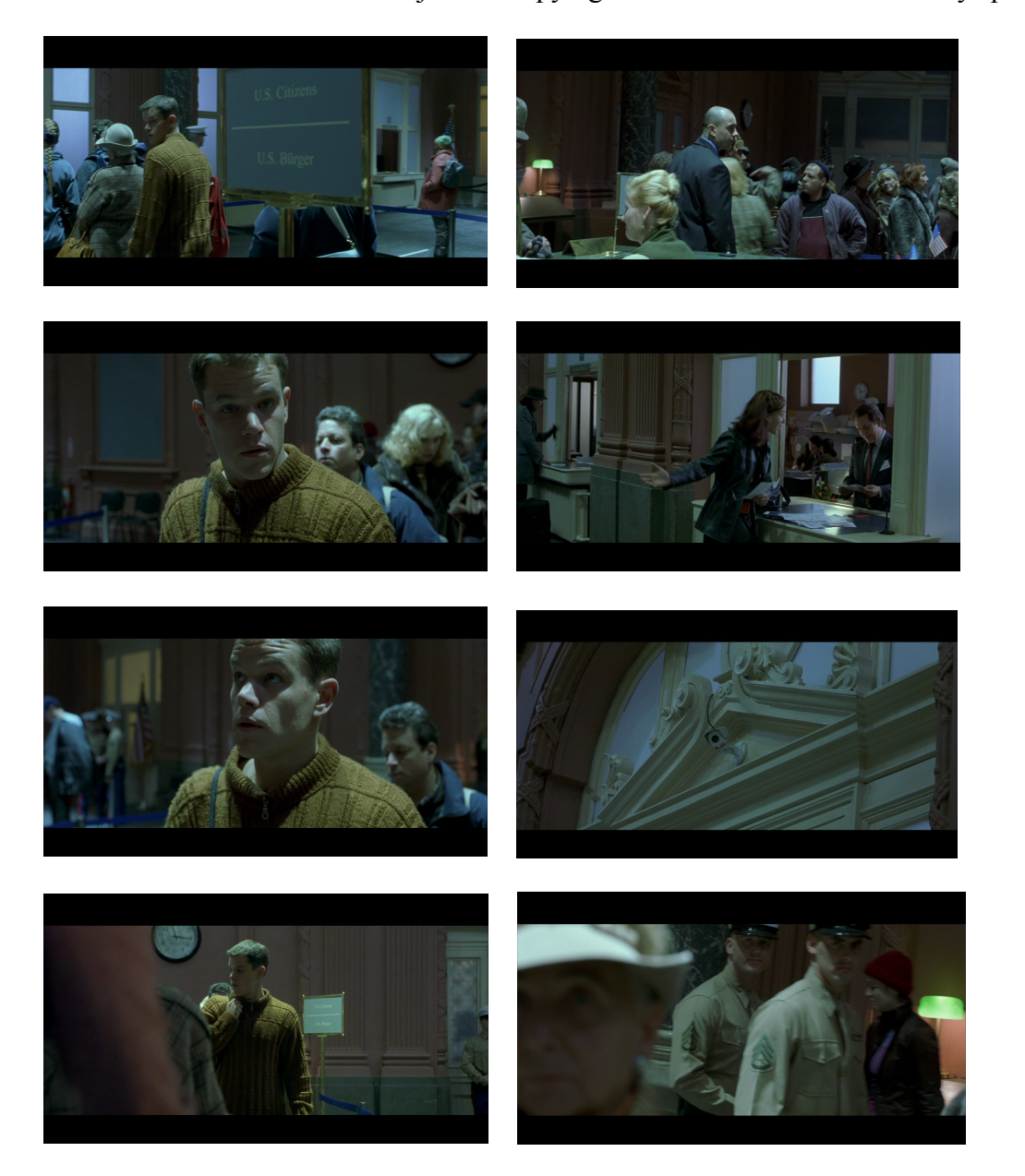
Figures 2.1-2.8: Pointof-view editing in The Bourne Identity (Doug Liman, Universal Pictures, 2002).

I see character A looking off-screen right; the next shot shows character B, and I infer that B is the object of A's gaze. A sequence in The Bourne Identity (Doug Liman, 2002) shows the technique in action (figures 2.1 - 2.8). Pursued by police, Jason Bourne (Matt Damon) seeks refuge in the US Embassy in Zurich. He joins a line of American citizens awaiting service. The space of the embassy is now mapped out by a series of point-of-view edits, alternating shots of Bourne glancing off-screen with shots of other characters and objects occupying different zones of the embassy space: