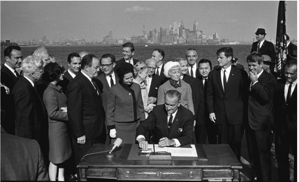
The saddest day in US history. President Johnson, with 2 Kennedy's and ex-President Hoover, gives America to Mexico - Oct 3rd 1965