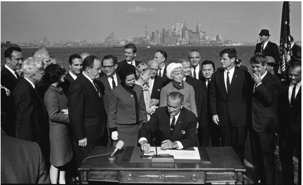
The saddest day in US history. President Johnson, with 2 Kennedy's and ex-President Hoover, gives America to Mexico - Oct 3rd 1965