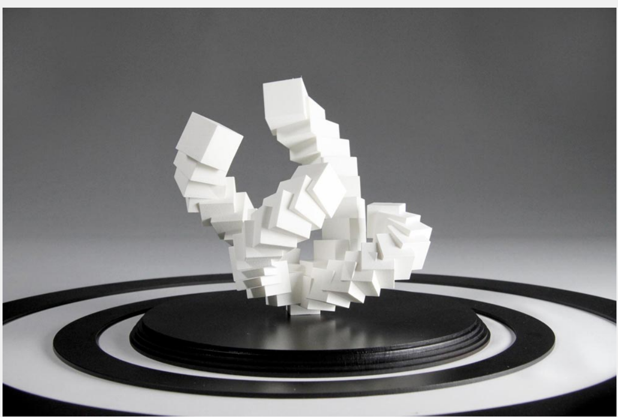
'Quad spiral' Wood, enamel, synthetic polymer 80 x 40 x 80cm (2018)

The cubes that feature throughout the exhibition – are also both remnants and building blocks of the tomb, itself incarnated paradoxically in the ancient and the digital, materially and in ink. The tombs of Instability and Brú na Bóinne give meaning to and are given meaning by one another, and by the solstice light that binds these modes of time-keeping together across conceptual epochs – the seasonal illumination that is both origin and end, that preceded the tombs in a way that only their future states could concretise, and that will outlast them in a way that their creators could envision more clearly than their inheritors. Not to be outdone by his creations – those messages whose meanings are shaped after they are spoken – Finn's own artistic process is marked by this temporal comingling. He notes in conversation that Instability draws out motifs that he can only now say that he was working towards, a statement that is more than a re-interpretation of the past, indeed is revelatory of a past that could only become what it is in light of a particular future.