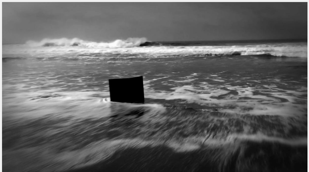
Liquid Cube analysis' HD video still (2018)

Consider the pieces that show construction and destruction rendered from multiple vantage-points across different media – simulated digitally, drawn in ink, enacted sculpturally. The tomb at the heart of Instability , a monument received in ways its builders could not have imagined, even as the process of their building across and into time could not have been what it is without these future reinterpretations. In these works, the 'now' is not shattered so much as revealed to have never truly been, at least in the splendid isolation that we have vainly associated with the concept of presence. In resisting attempts to separate the exhibition's temporal loops into sequential narratives, Instability both foregrounds and undercuts linearity itself by revealing the latter's reliance upon a deeper temporal intermingling.