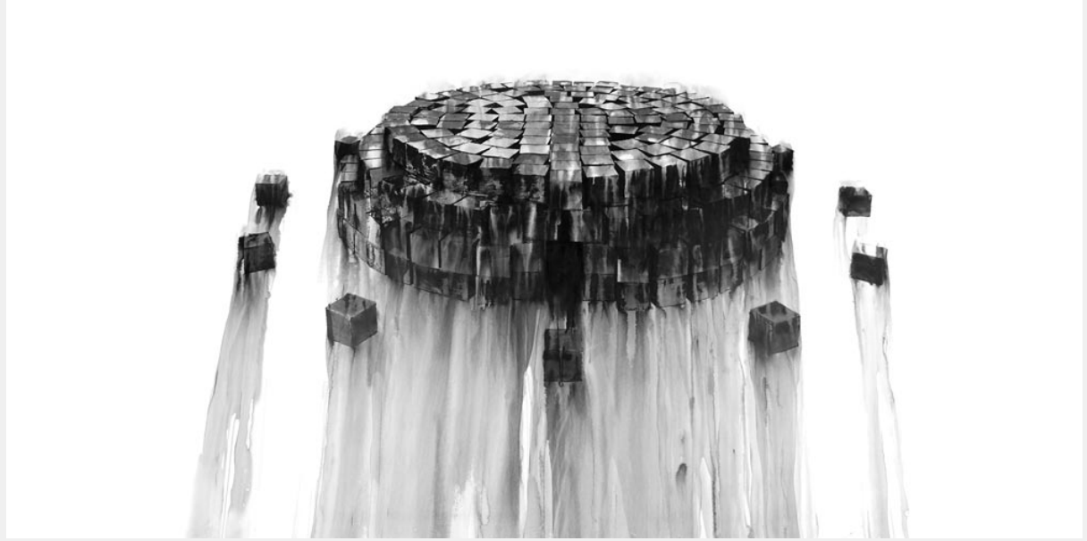
'Tomb Entrance' Ink on paper 192 x 112 cm (2018)

"We must understand time as the subject and the subject as time." Maurice Merleau-Ponty