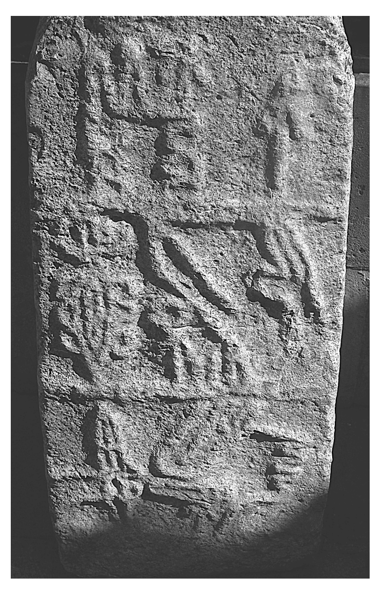
Fig. 2. Photograph of ÇALAPVERDI 3 by H. K. Şenyurt.

that zi/a should be transliterated HIC in similar contexts to this, and that it functions as a logogram.<sup>10</sup> Translation (b) assumes that this is the case.