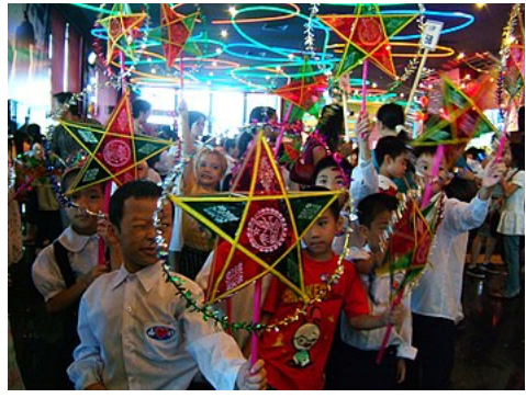
A lantern procession during Mid-Autumn Festival (Tết Trung thu) in Vietnam, which is also celebrated as "Children's Festival".