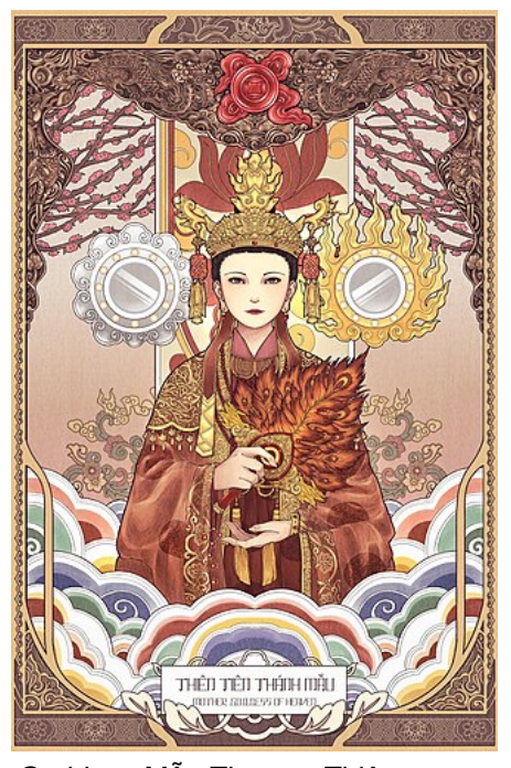
Goddess Mẫu Thượng Thiên

The surviving family wear coarse gauze <u>turbans</u> and <u>tunics</u> for the funeral. There are two types of funeral processions: