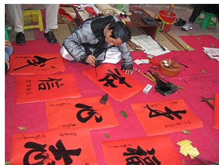
Hán-Nôm calligraphy in Vietnam