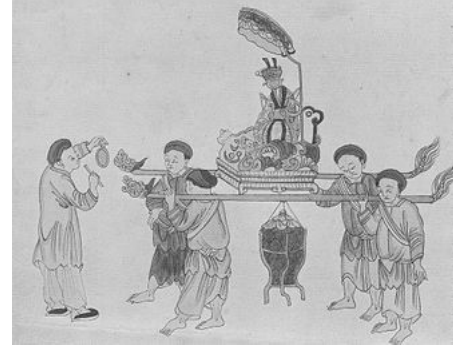
Ceremonial procession of <u>Thanh</u> hoàng, 19th century