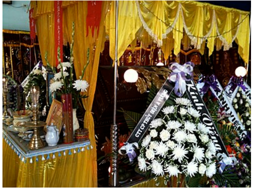
Decorations placed around a coffin at a home funeral in Danang

In feudal Vietnam, clothing was one of the most important marks of social status and strict dress codes were enforced. After the Ming conquest of Vietnam, Ming-style clothing was imposed by a Ming official within a month. Due to the previous centuries of conflict between China and Vietnam, Ming administrators said that their mission was to attempt to "civilize" the unorthodox Vietnamese "barbarians", [30] which ironically reduced the amount of Taoist institutions in the process.