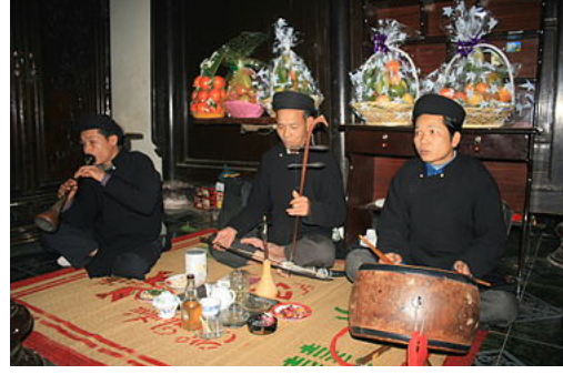
A trio of Vietnamese musicians performing together. The man on the far left plays kèn đám ma, the man in the middle plays the <u>đàn nhị</u> and the man on the right plays the trống chầu.