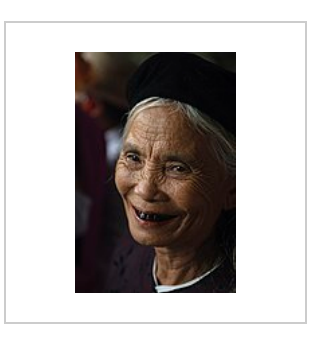
A Kinh Vietnamese woman with blackened teeth due to chewing betel nut, a common practice in Vietnam