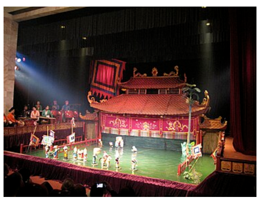
Water puppet theatre in Hanoi

Despite nearly dying out in the 20th century, water puppetry has been recognized by the Vietnamese government as an important part of Vietnam's cultural heritage. Today, puppetry is commonly performed by professional puppeteers, who typically are taught by their elders in rural areas of Vietnam.