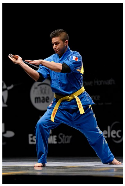
Vovinam demonstration in France in

Prior to Han Chinese migration from the north, the <u>Yue tribes</u> cultivated wet rice, practiced fishing and <u>slash-and-burn</u> agriculture, domesticated <u>water buffalo</u>, built <u>stilt houses</u>, tattooed their faces, and dominated the coastal regions from shores all the way to the fertile