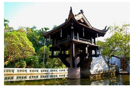
Hanoi's <u>One Pillar Pagoda</u>, a historic Buddhist temple

Besides <u>folk</u> religion, religion in Vietnam has historically been a mix of <u>Buddhism</u>, <u>Confucianism</u>, and <u>Taoism</u>, known in Vietnamese as the <u>Tam Giáo</u> ("the three religions"). [23] Recently, scholars have provided empirical evidence on the existence of the socio-cultural phenomenon called "cultural additivity" in Vietnamese history and society. [24] Some elements considered to be unique of Vietnamese culture include ancestor veneration and respect for community and family. [25]