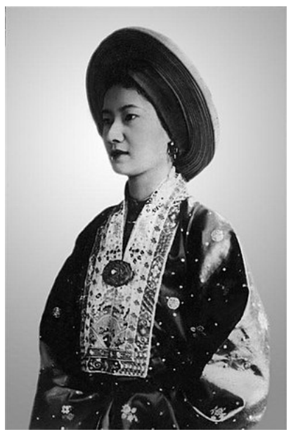
Empress Nam Phương wearing áo nhật bình and khăn vành dây