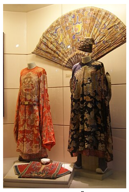
Court attires of Nguyễn Dynasty