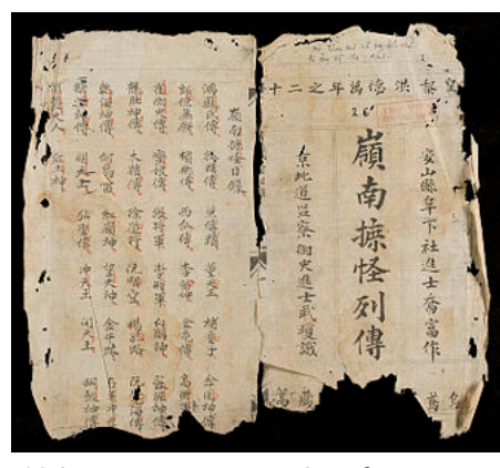
19th-century manuscript of "Mysterious tales of the Southern Realm" (Lĩnh Nam chích quái), a copy of 15th-century original tale.

Vietnam has had a diverse range of cultural poetry throughout its history. [14] Historically, Vietnamese poetry consists of three language traditions. Each poetry was written exclusively in Classical Chinese and later incorporated Sino-Vietnamese vocabulary. It was also often centered around the themes and traditions of Buddhism and Confucianism. [15][16] This style of poetry remained prominent until the 13th century. Thereafter, poetry and