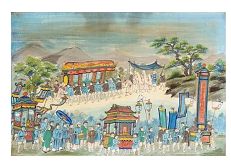
Vietnamese painting depicting a funeral during the Nguyễn dynasty