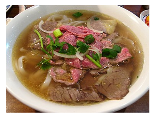
Vietnamese phỏ , noodle soup with sliced rare beef and well done beef brisket

In the imperial court, there also developed throughout the centuries a series of complex court dances which require great skill. Some of the more widely known are the imperial lantern dance, fan dance, and platter dance, among others.