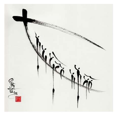
Vietnamese calligraphy depicting people on a boat, the calligraphy says, "Thuyền nhân"