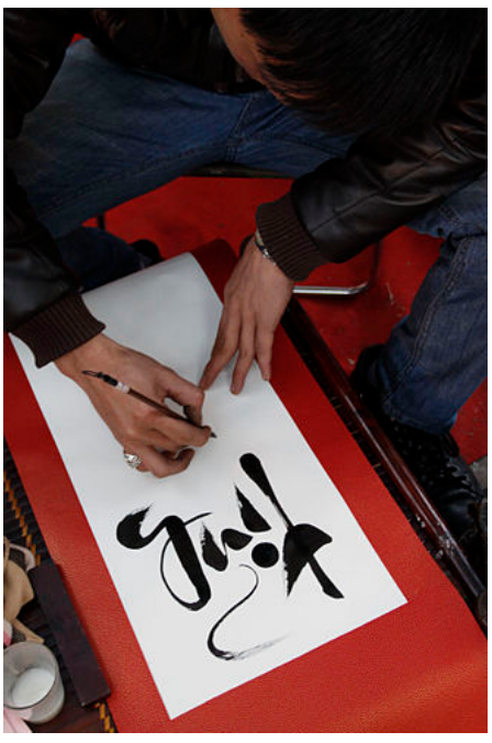
In Chữ Quốc Ngữ, the word "tính" means "to ponder" or "figure out".

A folk art with a long history in Vietnam, <u>Vietnamese</u> woodblock prints have reached a level of popularity outside of Vietnam. Organic materials are used to make the paint, which is applied to wood and pressed on paper. The process is repeated with different colors.