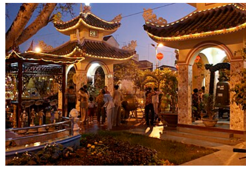
<u>Tet Vietnamese New Year</u> Festivities in Chau Doc, Vietnam.

Among the traditional holidays, the two most important and widely celebrated are the <u>Lunar new year (Tết)</u>, followed by the <u>Mid-autumn lantern festival</u> (<u>Tết Trung Thu</u>), although the latter has been losing ground in recent years.