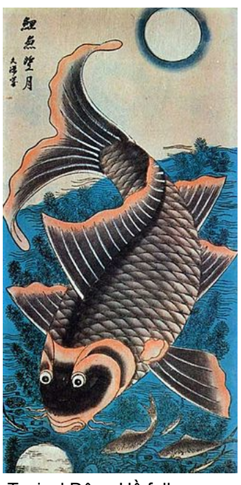
Typical <u>Đông Hồ folk</u> woodblock print of a carp

In the 20th century, in contact with the Western culture, especially after national independence, many new categories of arts like plays, photography, cinemas, and modern art had taken shape and developed strongly, obtaining huge achievements with the contents reflecting the social and revolutionary realities. Up to 1997, there have been 44 people operating in cultural and artistic fields honored with the Hò Chi Minh Award, 130 others conferred with People's Artist Honor, and 1011 people awarded with the Excellent Artist Honor. At the start of 1997, there were 191 professional artistic organizations and 26 film studios (including central and local ones). There have been 28 movies, 49 scientific and documentary films receiving international motion picture awards in many countries.