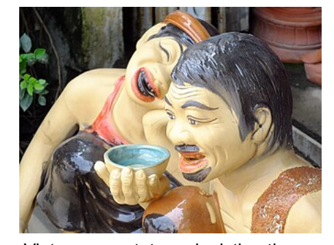
Vietnamese statues depicting the traditional practice of <u>teeth</u> blackening (nhuộm răng đen)

A royal edict was issued by the <u>Lê dynasty</u> in 1474 forbidding Vietnamese from adopting foreign languages, hairstyles and clothing of the Lao, Champa or the "Northerners" which