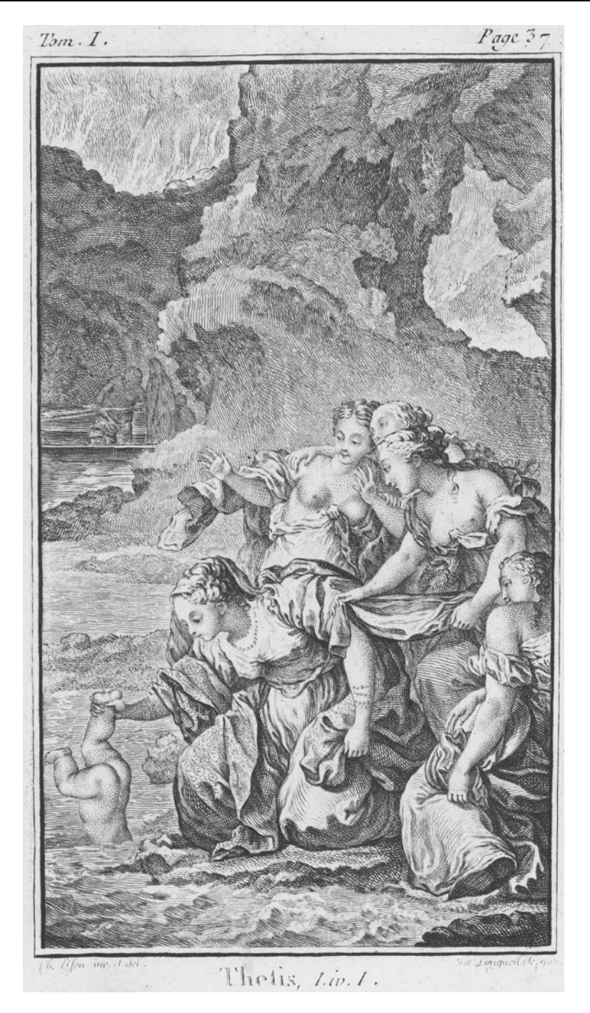
Picture 2 Jean-Jacques Rousseau, Emile, ou de l'éducation , A La Haye : chez Jean Néaulme, libraire, 1762, 4 t. in-8°. Frontispiece of vol. 1. Bibliothèque de Genève, Rsa 251/1