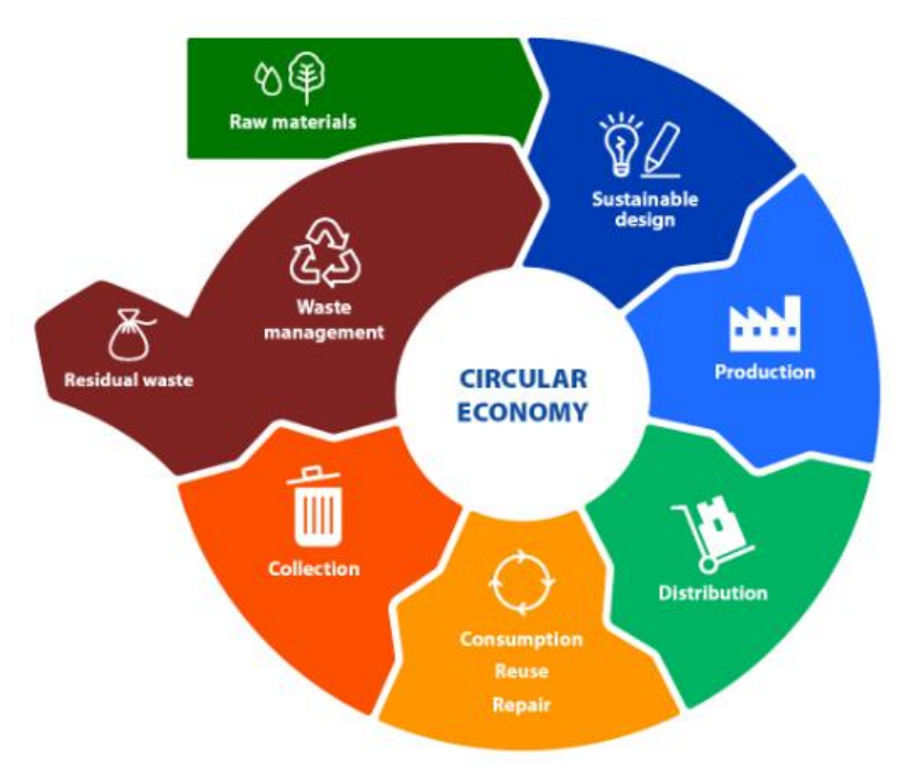
Figure 1: Circular economy model.