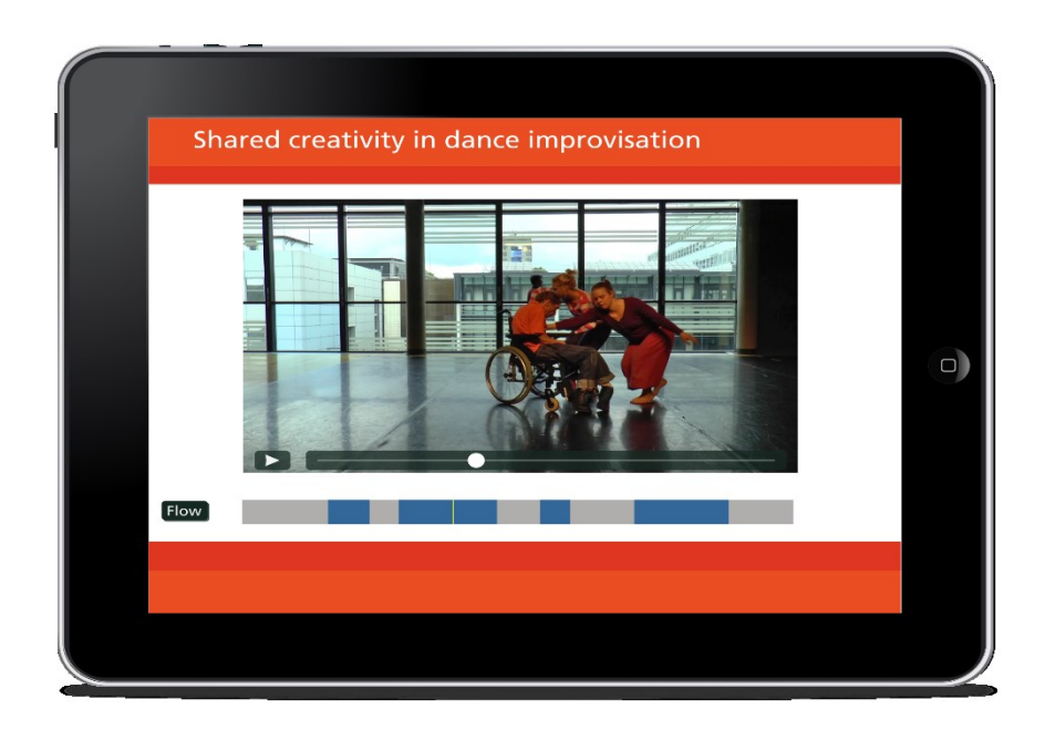
Figure 2. A video simulated recall method—tablet view.

synchronize voice reports with video content. The system also recorded and visualized a single tap on the flow button, which changed the reported flow state at the current time in the video from flow to not-flow and vice versa (Figure 2).