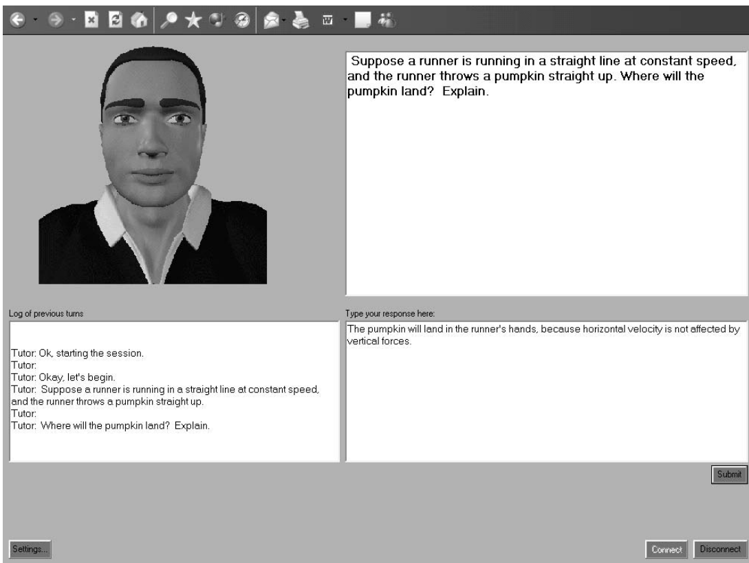
Fig. 2. User interface of Why2-AutoTutor.

The Why2-AutoTutor students used a slightly different user interface, which is shown in Fig. 2. The window in the lower right quadrant accommodated whatever the student typed in during the current turn. The student's turn was processed with a speech act classifier (Olney et al., 2003) and a statistical natural language processing (NLP) technique called latent semantic analysis (LSA; Foltz, Gilliam, & Kendall, 2000; Graesser et al., 2000; Landauer, Foltz, & Laham, 1998). In the upper left window, an animated conversational agent had a text-to-speech engine that spoke the tutor's turns. It used facial expressions with emotions when providing feedback on the student's contributions. The agent also used occasional hand gestures to encourage the student to type in information. The recent dialogue history was displayed in a scrollable window in the lower left of the display. The tutor's most recent turn was added immediately after the tutor had finished speaking it.