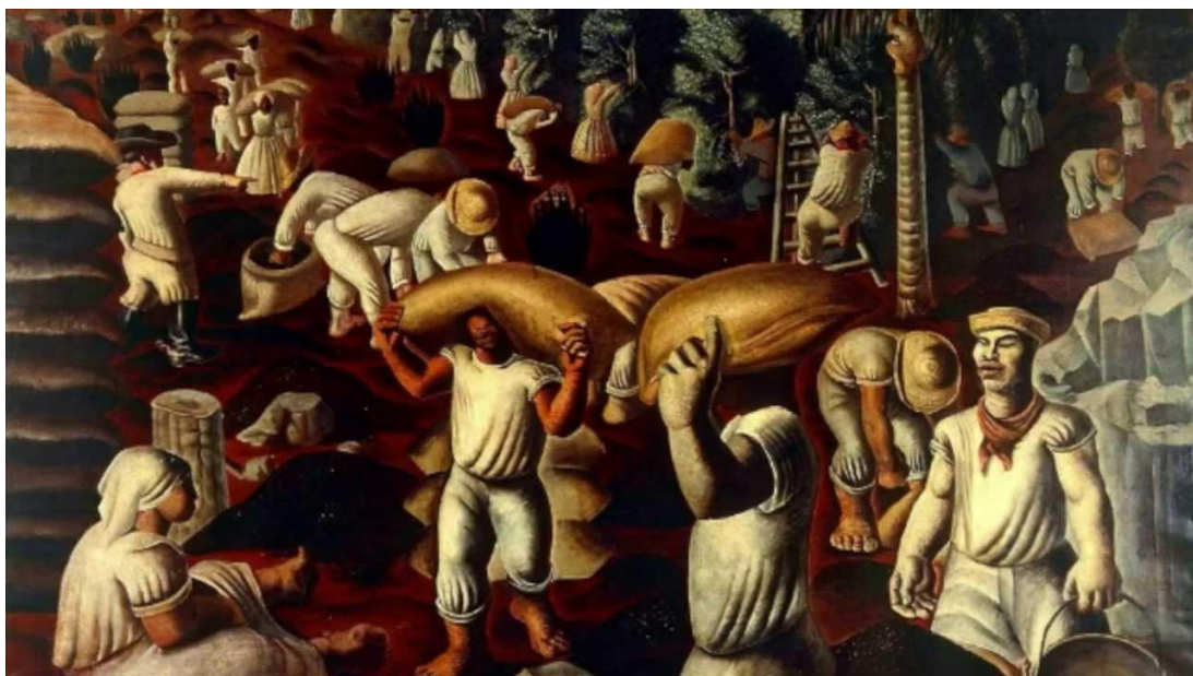
Figure 3: Café , Candido Portinari, 1935 (Museu Nacional de Belas Artes, Brazil)

They comprise childhood memories, very present in his artistic construction. The problem of man and reality are focal points in the Portinarian iconography. The landscape-scenario which hosts them is a redefinition of the space of a land lived, bound by lines and perspectives, characteristic of his memory of the trails in coffee plantations, in a hierarchy of planes and chromatic masses which reveal the cosmic force, the depth of the horizon, and the luminosity of the essence of life brought out by the theme of painting [14].