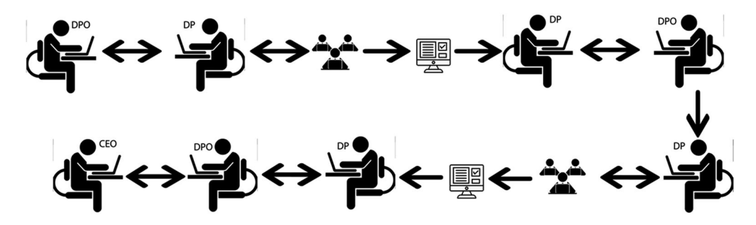
Figure 3. The employees' role in designing gamified workplaces.

Additionally, based on the correctives in the RRI framework, the employees should play an active role in the gamified application design process. The second scenario features this incorporation of employee preferences during system design, and is presented in Figure 3. Taking into consideration the harmful and non-harmful game elements mentioned previously, the organisation DPO informs the person responsible for the HR department about the elements. Next, this person records the elements that each employee prefers to be part of the design of the gamified application that they will be