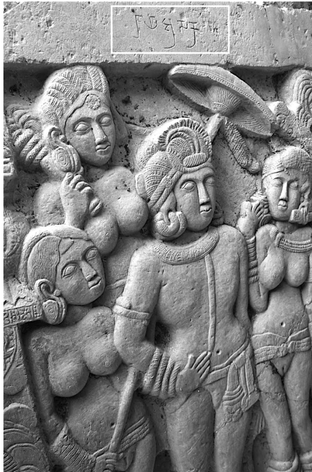
Figure 3 Stone Portrait With Brahmi Inscription (Marked) 'Ranyo Ashoka'; Sannati Kanaganahalli Sculpture