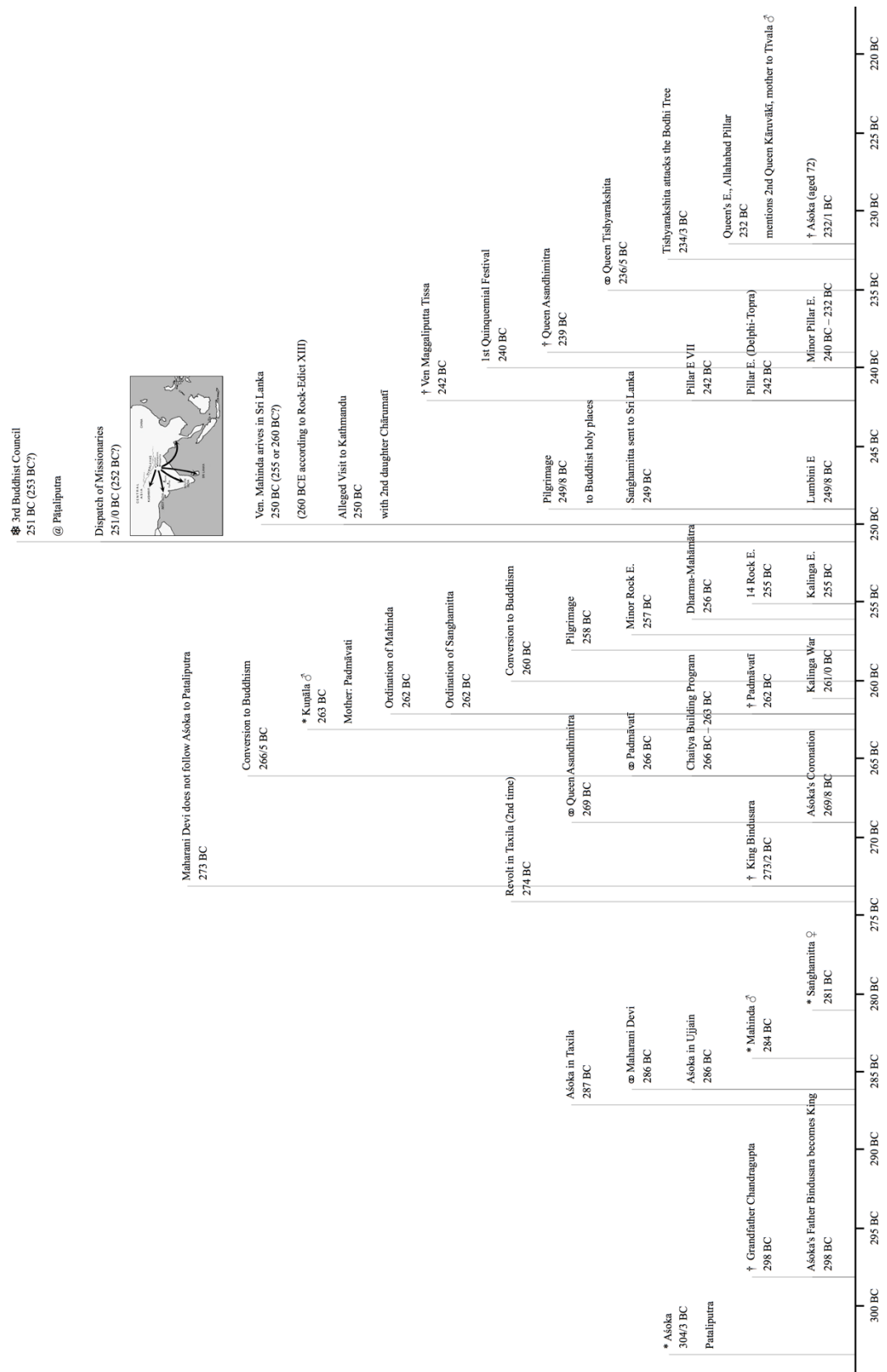
Figure 1 Summary Of Approximate Life Events Of Aśoka Main Sources: Smith 1980, Allen 2012, Radhakumud 1995