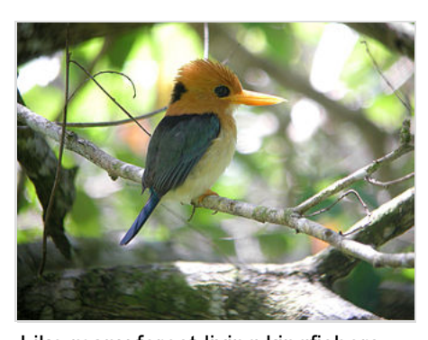
Like many forest-living kingfishers, the <u>yellow-billed kingfisher</u> often nests in arboreal termite nests.