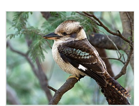
The <u>kookaburra</u> has a birdcall which sounds like laughter.