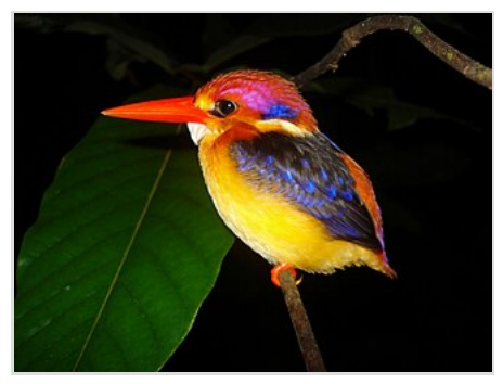
The <u>Oriental dwarf kingfisher</u> is considered a bad omen by warriors of the Dusun tribe of Borneo.