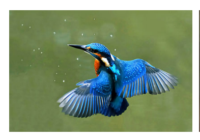
Common kingfisher hovering