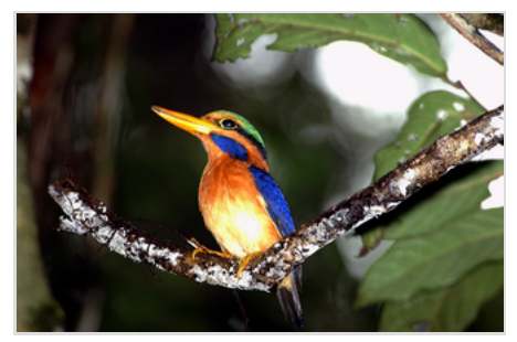
The <u>rufous-collared kingfisher</u> is categorised as <u>near-threatened</u> due to the rapid loss of its rainforest habitat.

For the <u>Dusun</u> people of <u>Borneo</u>, the <u>Oriental dwarf kingfisher</u> is considered a bad omen, and warriors who see one on the way to battle should return home. Another Bornean tribe considers the banded kingfisher an omen bird, albeit generally a good omen. [9]