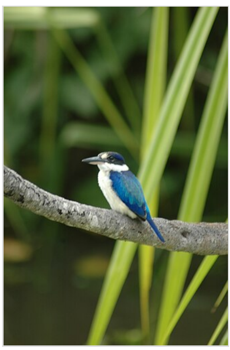
Forest kingfisher in <u>Kakadu National</u> Park