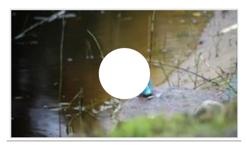
Kingfisher catching fish, eating, defecating, and flying in Kõrvemaa, Estonia (October 2022)

Kingfishers feed on a wide variety of prey. They are most famous for hunting and eating fish, and some species do specialise in catching fish, but other species take <u>crustaceans</u>, frogs and other <u>amphibians</u>, <u>annelid</u> worms, <u>molluscs</u>, insects, spiders, <u>centipedes</u>, reptiles (including snakes), and even birds and mammals. Individual species may specialise in a few items or take a wide variety of prey, and for species with large global distributions, different populations may have different diets. Woodland and forest kingfishers take mainly insects, particularly grasshoppers, whereas the water kingfishers are more specialised in taking fish. The red-backed kingfisher has been observed hammering into the