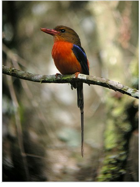
The <u>paradise kingfishers</u> of New Guinea have unusually long tails for the group.

The following cladogram is based on a molecular phylogenetic study published in 2017. [8]