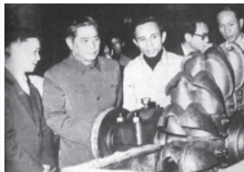
Figure 2: General Secretary of the CPVCC Nguyen Van Linh (Second from the Left) Visiting an Industrial Manufacturing Operation

His earnest fights against diseases, long existing within the political cadres, made him even internally criticized by a number of high-ranked colleagues since his writings touched on sensitive matters. Some even labeled his act as an equivalent to Mao Zedong's Cultural Revolution, but the reality proved that his sole purpose of fighting against these diseases had been to improve the image of the CPV as the leading political party and to reinforce the country's efforts to make necessary changes in its course of economic development.