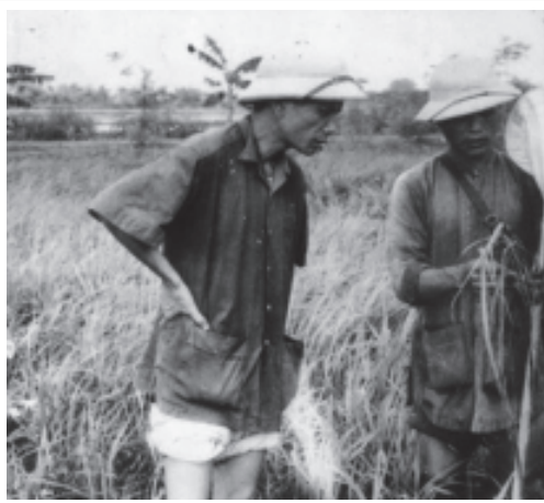
Figure 1: Kim Ngoc (Left), Party Secretary of Vinh Phuc Province 1966-67

The implementation of khoan policy took place during the period of escalated bombing by the US Air Force and severe drought in North Vietnam. However, the right policy generated promising outcome with rice yield for 1967 ranging from 5 to 7 MT/ha. Improved supply of rice also led to a substantial improvement in raising pigs (as popular food for Vietnamese). Collectively, the herd of pigs in Vinh Phuc in 1967 totaled 307,000, a 20% increase from 1966, and 38% higher than 1965. It cost almost nothing.