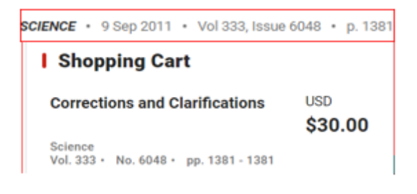
Figure 2: Paywall for Corrections.

For this article, the Erratum is free, which noted that a figure in the original paper was incorrectly assembled. A corrected figure was included in the Erratum and the original conclusion remained valid.