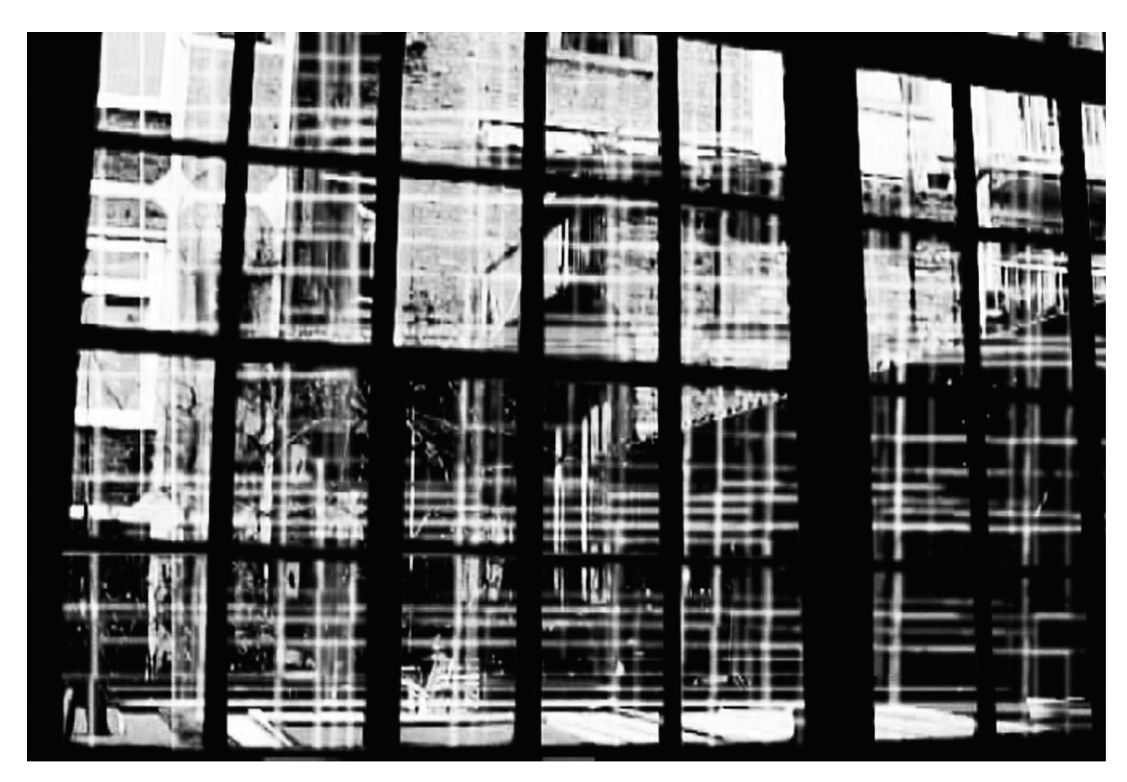
Figure 8: Screenshot of video composition: btd x, 2000.