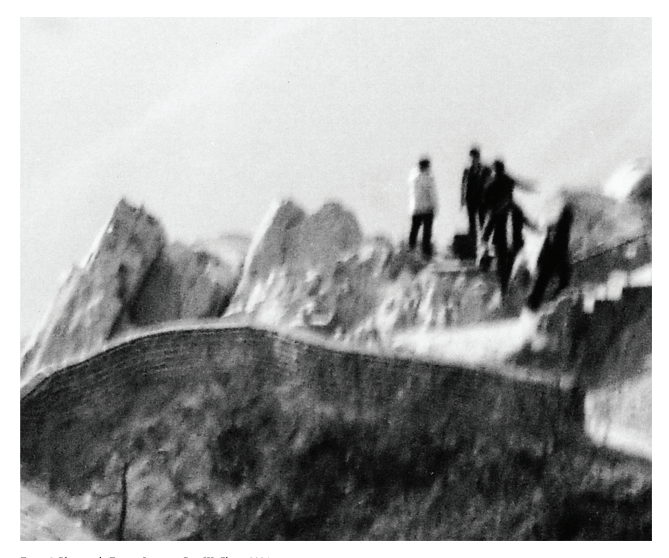
Figure 5: Photograph: Eastern Journey – Part III, China, 2004.