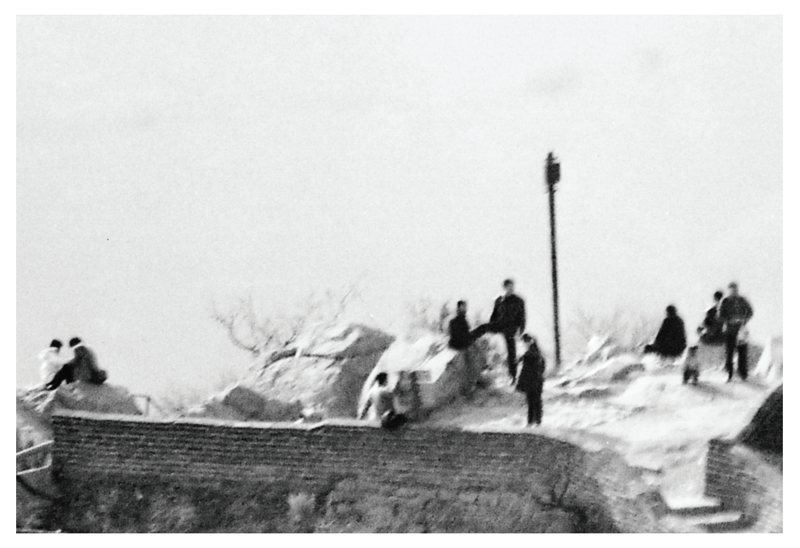
Figure 4: Photograph: Eastern Journey – Part II, China, 2004.