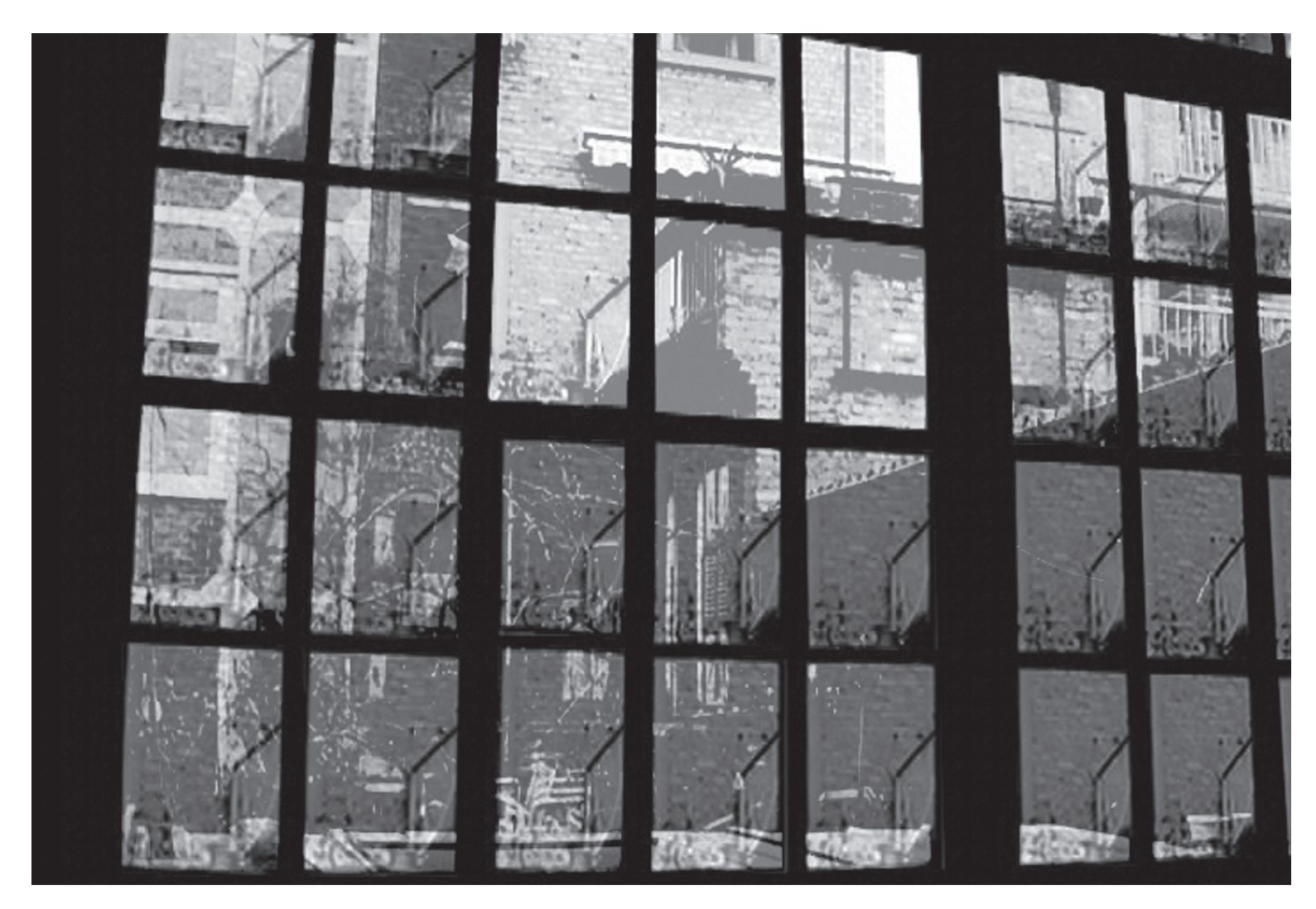
Figure 6: Screenshot of video composition: btd x, 2000.