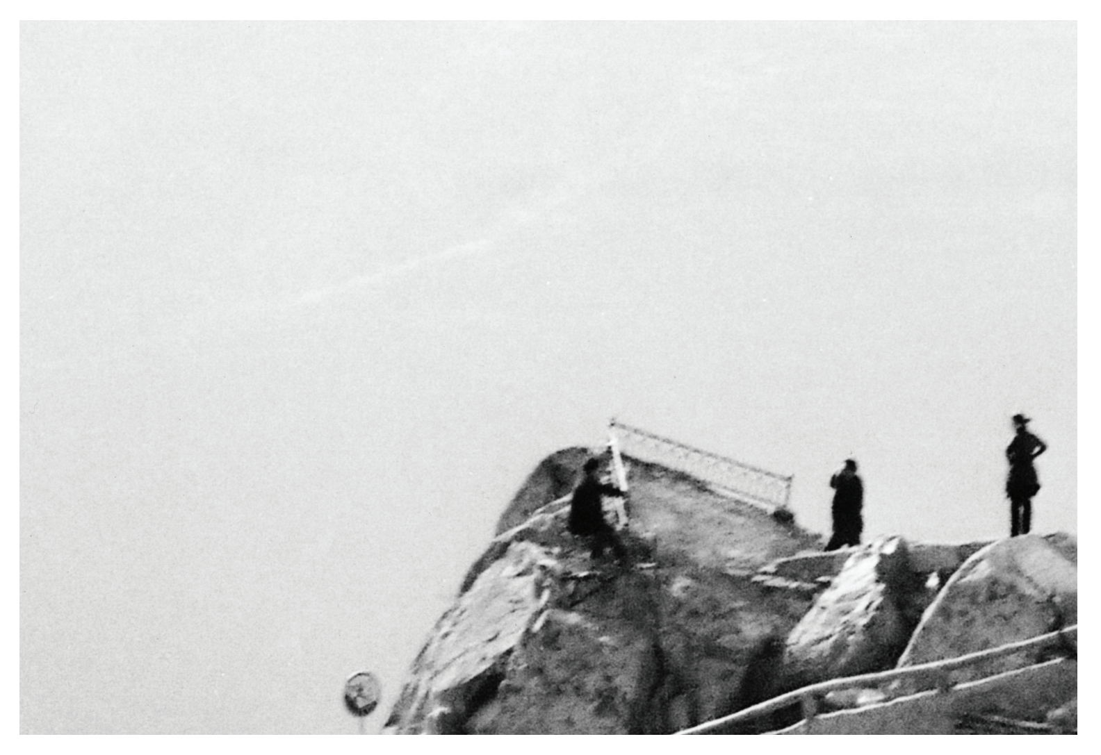
Figure 3: Photograph: Eastern Journey – Part I, China, 2004.