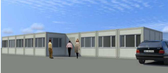
Fig. 4. Administrative modular building

Also, Slovakia, gets inspired by the use of modular constructions. In addition to that, there are some administrative buildings under construction as seen in Figure 4. In Slovakia, school facilities are still build using the traditional methods, which create the problem of underutilization.