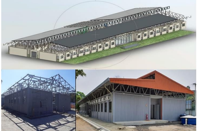
Fig. 6. Modular administrative building in Brazil [33]

construction was a possibility. Their knowledge indicated that the structure was a union of 34 metallic habitation modules, divided into four groups by a hallway. Chassis, roof, pillars, and trapezoidal steel plate for the exterior façade make up modules. High manufacturing rates, low lead times, reuse and mobility, flexibility, ecoefficiency, and sustainability are the key features and benefits of such structures. [33]