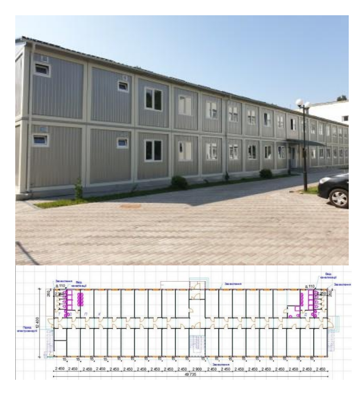
Fig. 2. A. Modular dormitory structure. Kiev, Ukraine. B. General Plan [20].

Another modular dormitory structure for 120 students was installed also in Kiev, Ukraine. The modular building has two floors and a common gable roof. The delivery set includes external escape stairs as well as internal stairs [20].