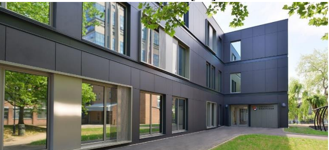
Fig. 3. Modular construction of the University of Birmingham offices [21].

Another modular dormitory structure for 120 students was installed also in Kiev, Ukraine. The modular building has two floors and a common gable roof. The delivery set includes external escape stairs as well as internal stairs [20].