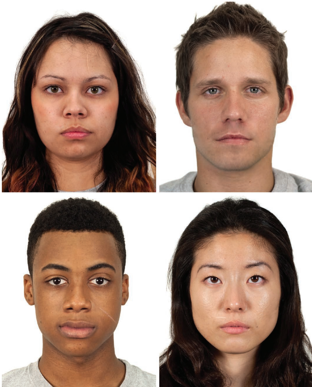
Fig. 2. Representative images viewed in face rating task. (Above, left) Hispanic woman with forehead, middle subunit, perpendicular scar. (Above, right) White man with lower, low border subunit, parallel scar. (Below, left) Black man with cheek, middle subunit, perpendicular scar. (Below, right) Asian woman with upper lip, middle subunit, perpendicular scar. (Used with permissions from Ma DS, Correll J, Wittenbrink B. The Chicago Face Database: A free stimulus set of faces and norming data. Behav Res Methods 2015;47:1122–1135.)

provide their ratings along a seven-point semantic differential scale to examine their perceptions of the photographs in terms of confidence, friendliness, and attractiveness. 2 The version of each face shown to participants was chosen in a counterbalanced fashion to guarantee a sufficient number of ratings for each scar.