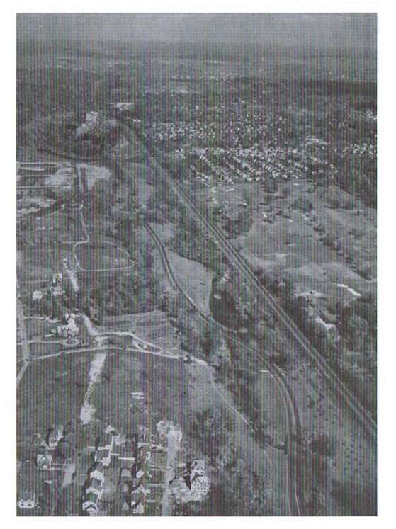
Figure 1. The Bronx River Parkway in the New York City suburbs, showing the contrast between curvilinear parkway design and straight railway design.

The commute on this parkway was naturalized to the extreme, with plants and trees shielding suburban development to passengers and drivers. Curvilinear road design predominated. The designers, among them Gilmore Clarke, a Cornell-trained landscape architect, extolled the ways in which both the natural and the social environment of the Bronx River Valley were restored through the planning and construction process: Instead of