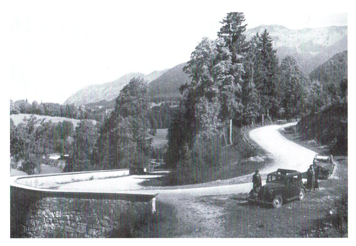
Figure 3. The German Alpine Road promised Alpine views; its users were invited, if not instructed, to leave their cars at designated parking areas and to go for a hike. Hans Schmithals, Die Deutsche Alpenstraße (Berlin 1936).

Not the least because of the Nazi sponsorship, work on the road did not continue immediately after the war. Some 60 kilometers were added and the road contributed to the staggering rise of Alpine tourism after World War II by opening up views of the Alps to non-hikers. But whether providing easy automotive access to the mountains was a desirable goal, a question that had not entered the public arena during the Nazi years, was very much under debate by the 1960s. When the Bavarian state government planned to construct an unrealized section of the Alpenstrasse from Linderhof to Füssen at the road's western end over the Hochplatte mountain (2082 meters above sea level) in 1965, conservationists were up in arms.